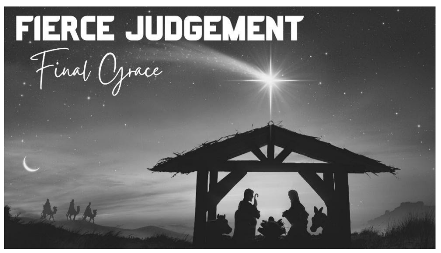
"But you, Bethlehem Ephrathah, though you are small among the clans of Judah, out of you will come for me one who will be ruler over Israel, whose origins are from of old, from ancient times." Micah 5:2