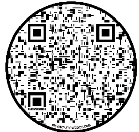
Amazon Wish List

We are excited to start our 20th year of learning! Please follow us on Facebook to find out all of the exciting things that will be happening. If you wish to help support our students, we are still looking for Prayer Sponsors and can always use donations from our Amazon Wish List.